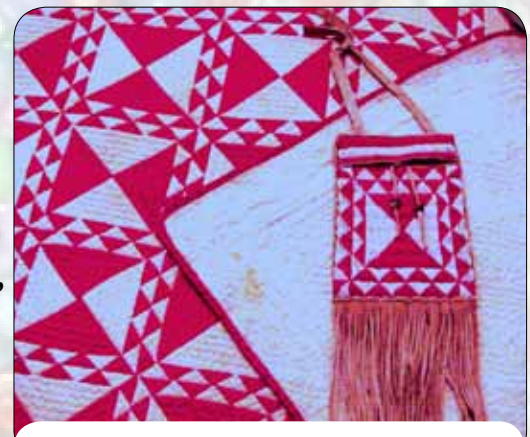
Strike-a-Light bag copying quilt design