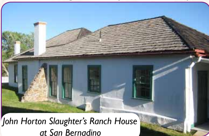
John Horton Slaughter's Ranch House at San Bernardino